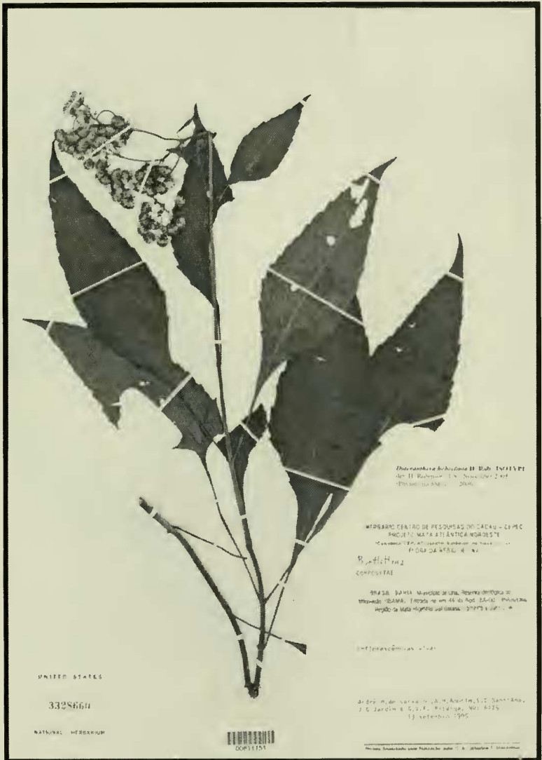
Fig. 4. Diacranthera hebeclinia H. Robinson, isotype, United States National Herbarium (US).